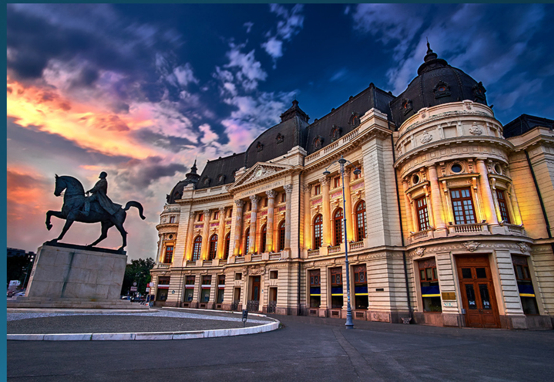
Central University library