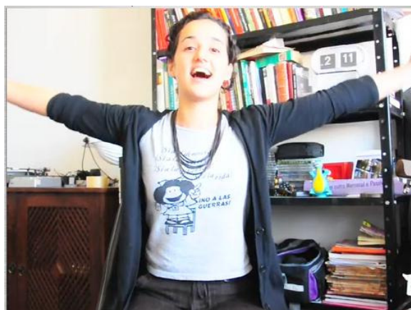
Figure 1: Illustration of an open arms movement.

Children with trisomy 21 (Down syndrome – DS) have the tendency to favor the use of gestural communication instead of spoken language, also avoiding combining vocalizations with hand drawings [Smith, 1987]. Another work [Tristão, and Feitosa, 1998], exposes the effectiveness of imitation on the verbal behavior of children with impairments, concluding that imitation plays an important role in language acquisition.