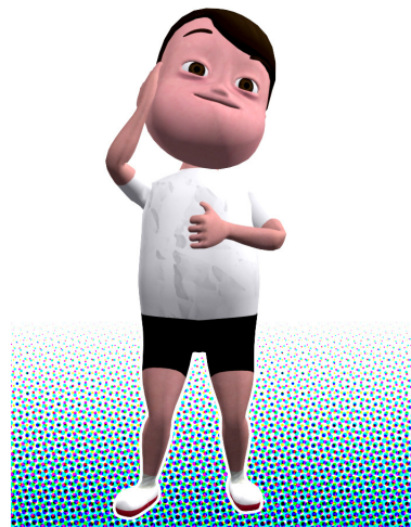
Figure 5: Pointing movement by the character

paradigm is interesting for this kind of user. We believe that our work promises contributions to the Human-Computer Interaction and Computer Vision areas, at the same time helping people with special needs by the use of computer games.