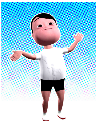
Figure 4: Open arms movement by the character

In this paper, we exposed some concepts of a game to stimulate children with DS. Our next steps are to conclude the development of the JECRIPE game, specially the movement recognition module mentioned in this text. Our goal is to offer an easy interaction for users with impairment, by recognizing broad gestures in front of a single camera. This kind of interaction may facilitate the interaction of this kind of user in comparison to a keyboard, mouse or gamepad.